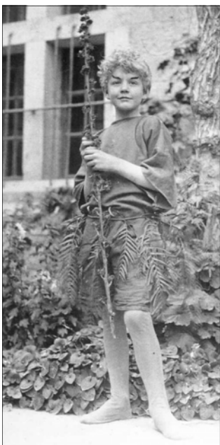
As "Puck," in Jerusalem